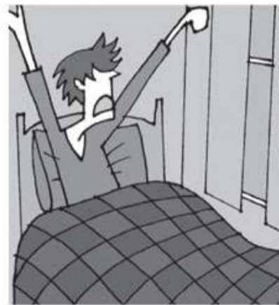
0 He has just _____ woken up.