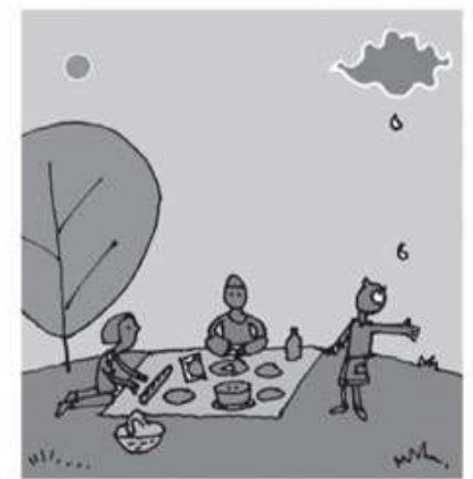
5 It _____