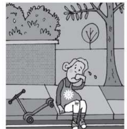
3 She _____