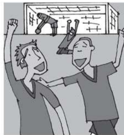
2 They _____