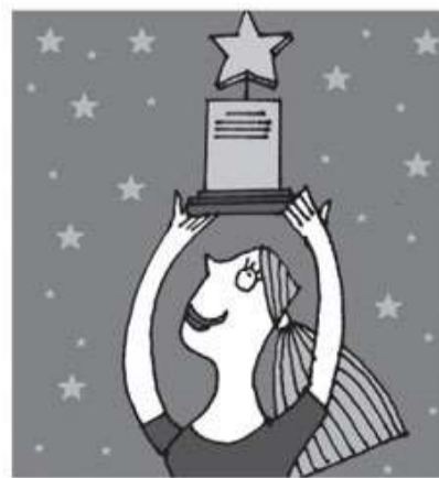
4 She _____