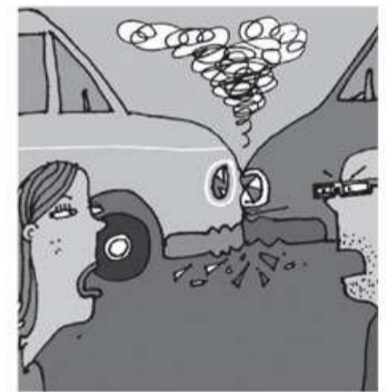
1 They _____